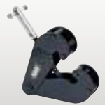
Beam clamp BC up to 5,000 kg