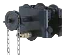
Chain driven trolley FNH up to 20,000 kg

info.de@swfkrantechnik.com www.swfkrantechnik.com