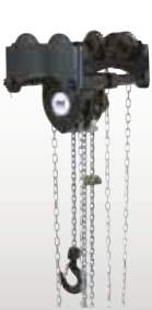
CRAFTster with chain driven trolley FKH with short headroom up to 20,000 kg