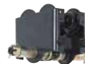
Push trolley FND up to 20,000 kg